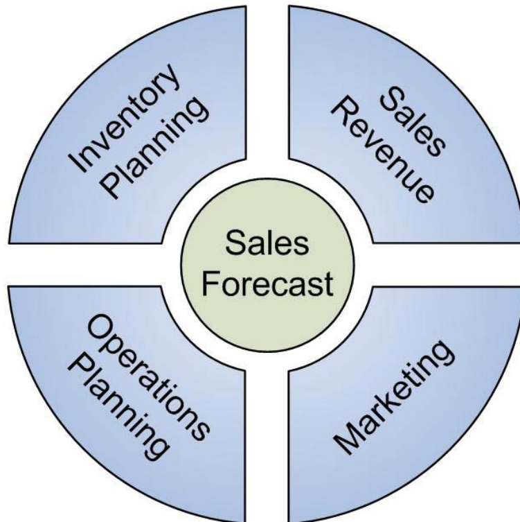
Figure 1: There are more customers for sales forecasts than just sales. This is why it is important to consider the other departmental needs when developing a sales forecast.

These uses include: Sales Revenue Forecasting, Inventory Planning, Operations Planning, and Marketing. Other departments may also have a use for this information. Keeping these uses and their respective departments in mind when developing a forecast can yield benefits throughout the organization.